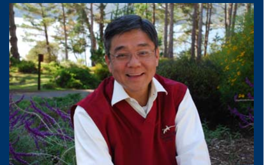
Lee Yih Layman's Foundation, Inc.