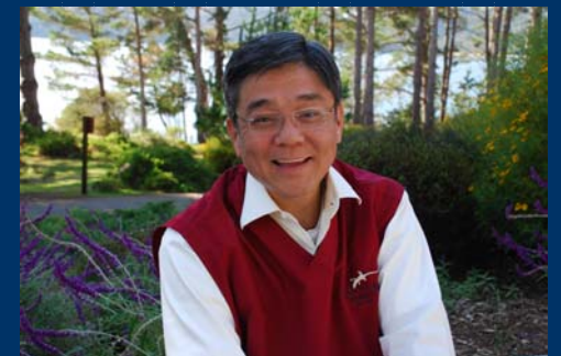
Lee Yih Layman's Foundation, Inc.