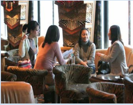
Mentors and Mentees mingling